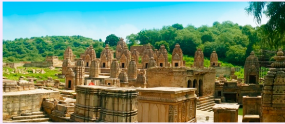
Bateswar Group of Temples

Pradesh. It is about 500 feet above ground level spread over an area of 8 km on a steep scarp of the Vindhya Range. Kachwaha Rajputs are said to have built the fort when they occupied Narwar in the 10th century. Kachwaha, Parihara, and Tomara Rajputs held Narwar successively from 12th century onwards, until it was captured by the Mughals in the 16th century. It was conquered by the Maratha chief Scindia in the early 19th century.