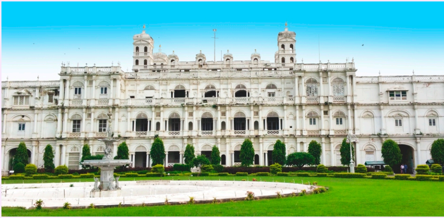
Jai Vilas Palace