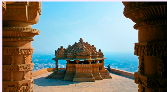
Sas Bahu ka Mandir